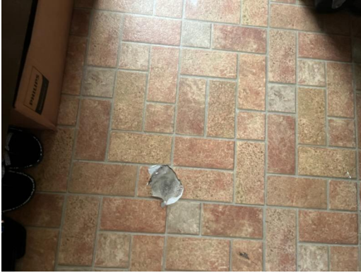
1509-1 Rolled Flooring/Mastic Typical Interior