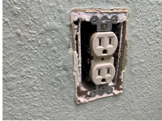
1509-2 Drywall/Joint Compound Typical Interior Walls/Ceilings