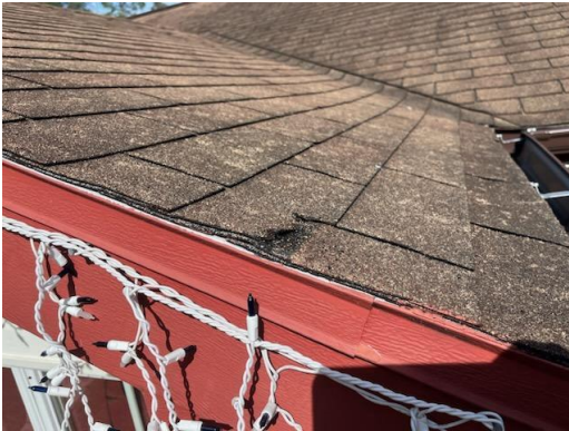
1509-3 Asphalt Shingle Typical Exterior Roof